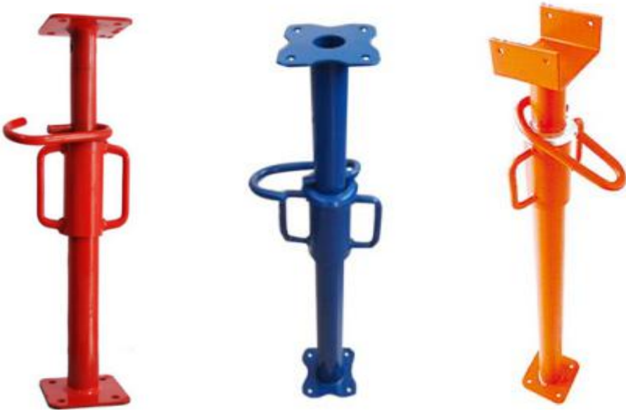
Cup type steel prop