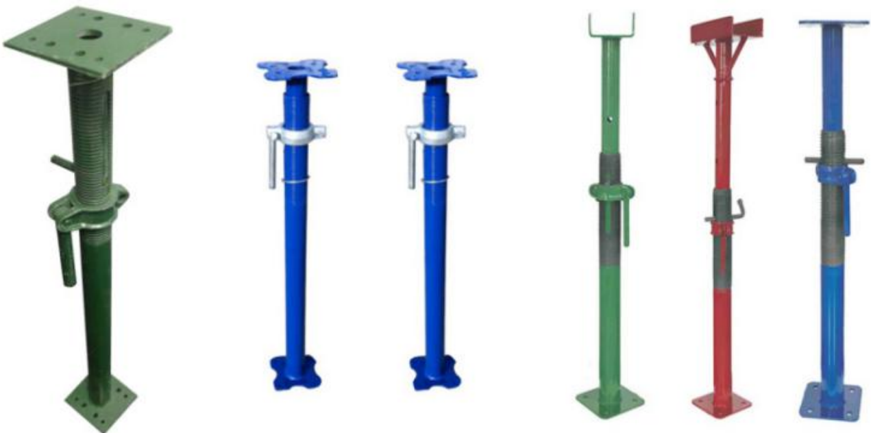
Common steel prop

TSX PRODUCTS FOR YOUR CONSTRUCTION NEED!