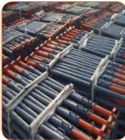
Product picture show